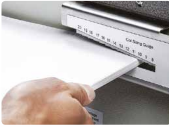
Built in coil sizing gauge.

The APSI offers a built in coil sizing gauge to help the operator confirm the diameter of coil required in relation to the book thickness.