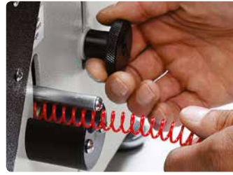
Coil diameter changeover

The APSI has gravity working to its advantage. The pre-punched book is positioned in the machine on its spine meaning that tabs or wider covers are no problem.