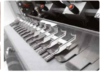
Built-in spine former storage.

The APSI does not require tools for basic setup and changeover. The APSI innovative coil diameter adjustment provides easy and accurate positioning.